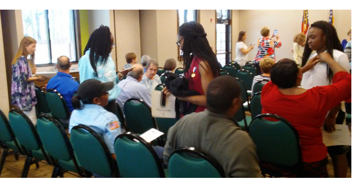
DAR Student Recognition