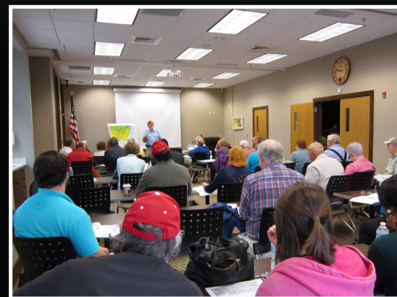
Sherman's March Tour