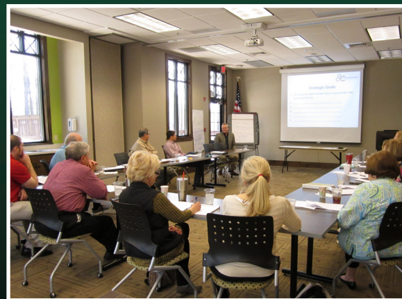
The Sunshine House Strategic Planning