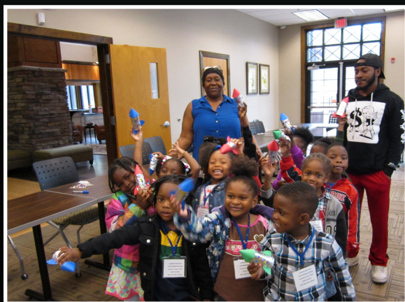
Louisville Head Start