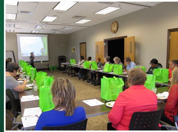
Total Wellness Series Part 1