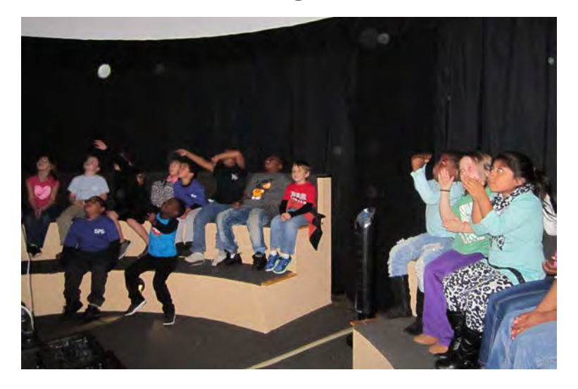
SPS 1st grade